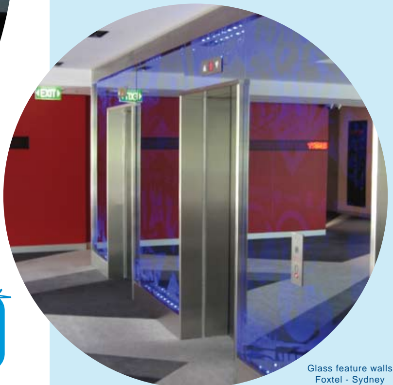
Glass feature walls Foxtel - Sydney

To make it easy to specify EnduroShield™ for your next project, a two page specification on each product is available to download at: www.enduroshield.com/specifications