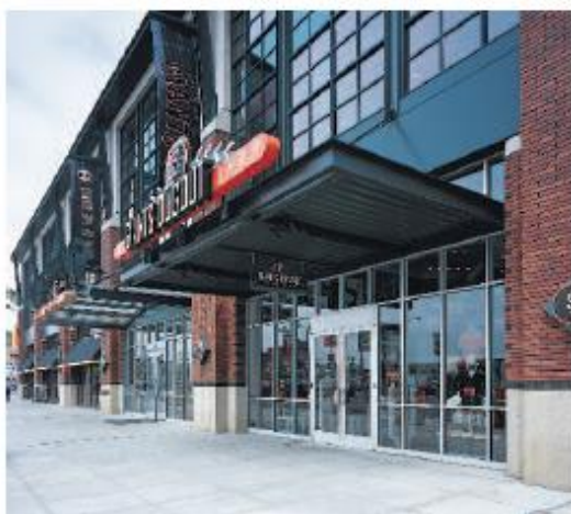
AT&T Park, San Francisco, CA Architect: Populous (formerly HOK Sport)